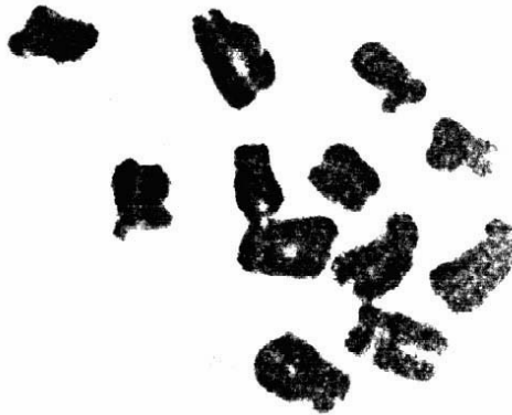
Figure 1 Metaphasis at Vicia sparsiflora Ten.

The chromosomes pairs I, II, III have the branch ratio between 3.20 and 5.06; they are from subtelocentric type. The chromosomes pairs IV, V, and VI, have the branch ratio between 2.37 and 2.72, being from submetacentric type (Figure 1, Figure 2, Figure 3).